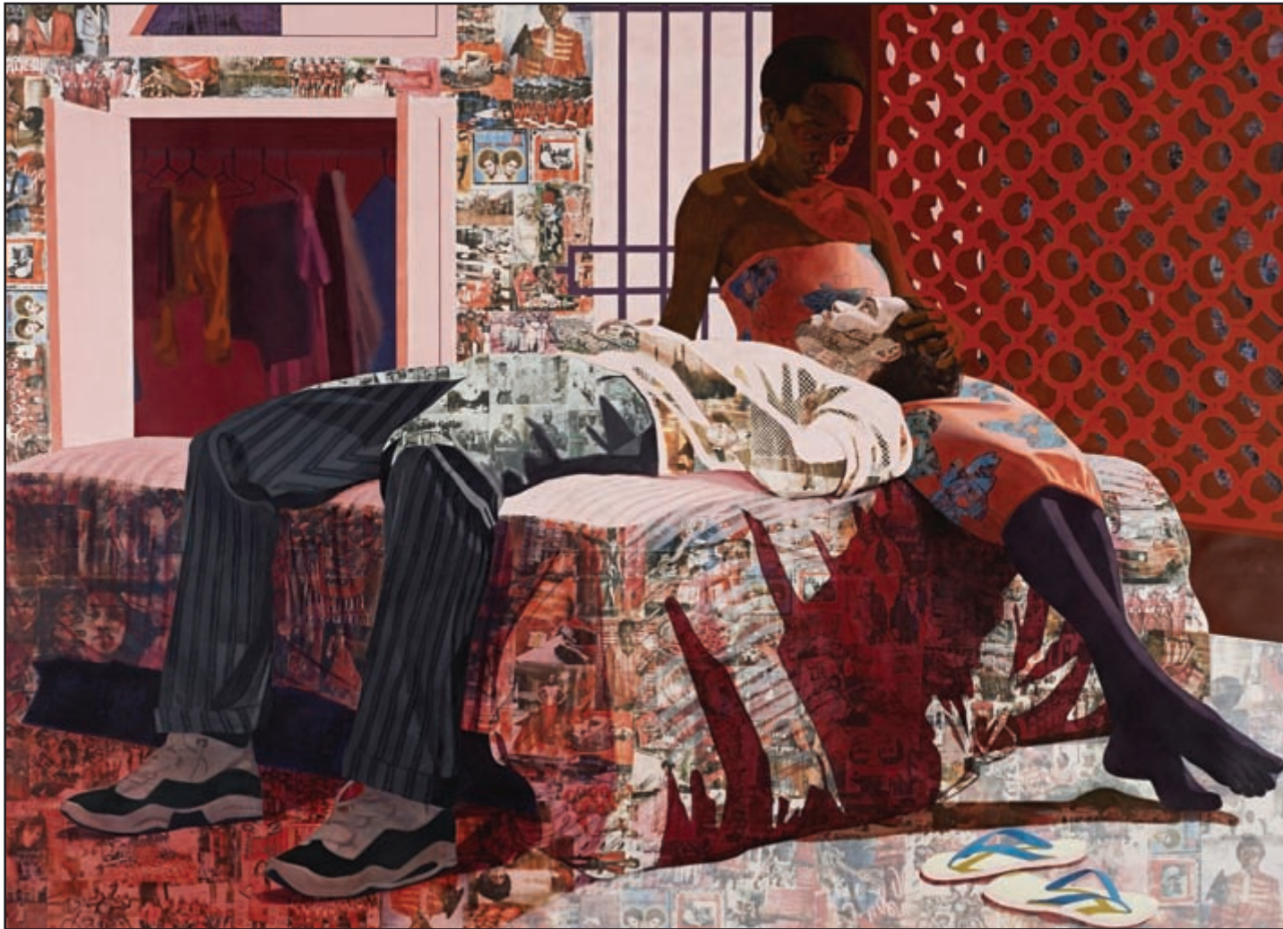
“Nwantinti,” a 2012 acrylic, charcoal, color pencil, collage and transfers on paper by Njideka Akunyili Crosby