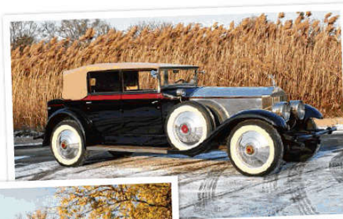
◀ 1928 Rolls-Royce Phantom I Newmarket Convertible Sedan by Brewster