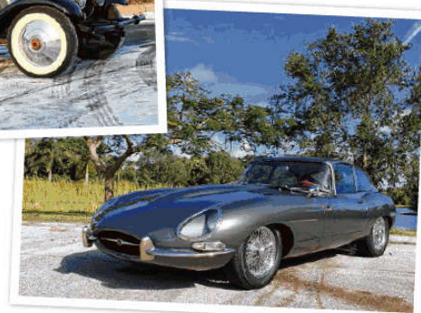
1966 Jaguar E type FHC