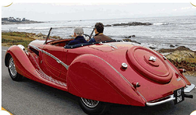
▲ 1938 Delahaye 135MS Figoni & Falaschi Torpedo Grand Sport