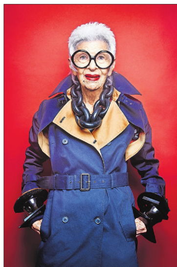
Head over to the Ann Norton Sculpture Gardens today for a chance to meet the one and only Iris Apfel. She will be signing copies of her new book.