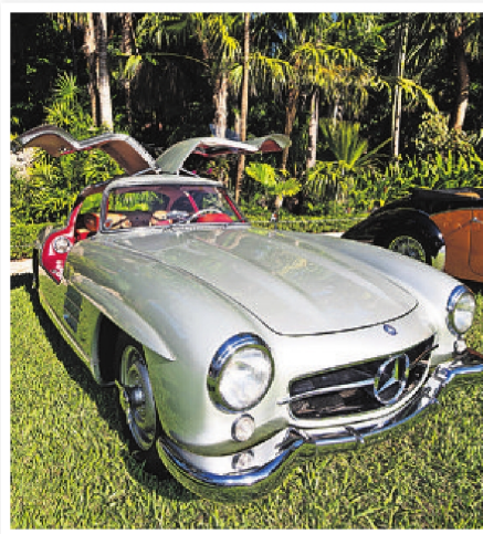
2018 People's Choice Award Winner: 1955 Mercedes 300SL Alloy Competition Gullwing