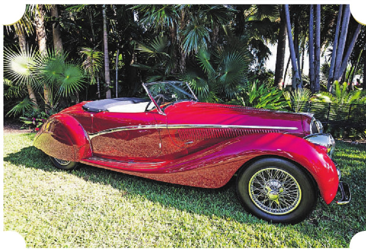
2018 Most Artistic Award Winner: 1938 Delahaye 135 MS Torpedo Grand Sport