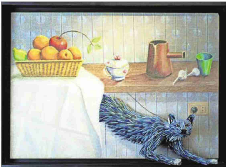
Federico Uribe's piece "Out" combines a colored pencil drawing with an image of a cat made with actual colored pencils.