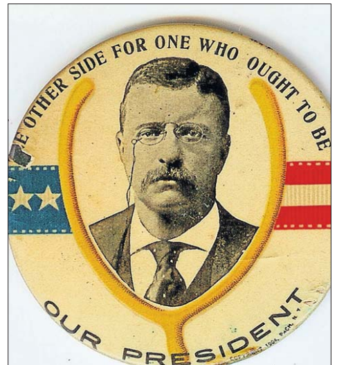
Amazing items like this Teddy Roosevelt campaign button will be on display Saturday during the 28th Annual South Florida Political and Historical Collectibles Show at Lake Worth Christian School.

28th Annual South Florida Political and Historical Collectibles Show, Lake Worth Christian School