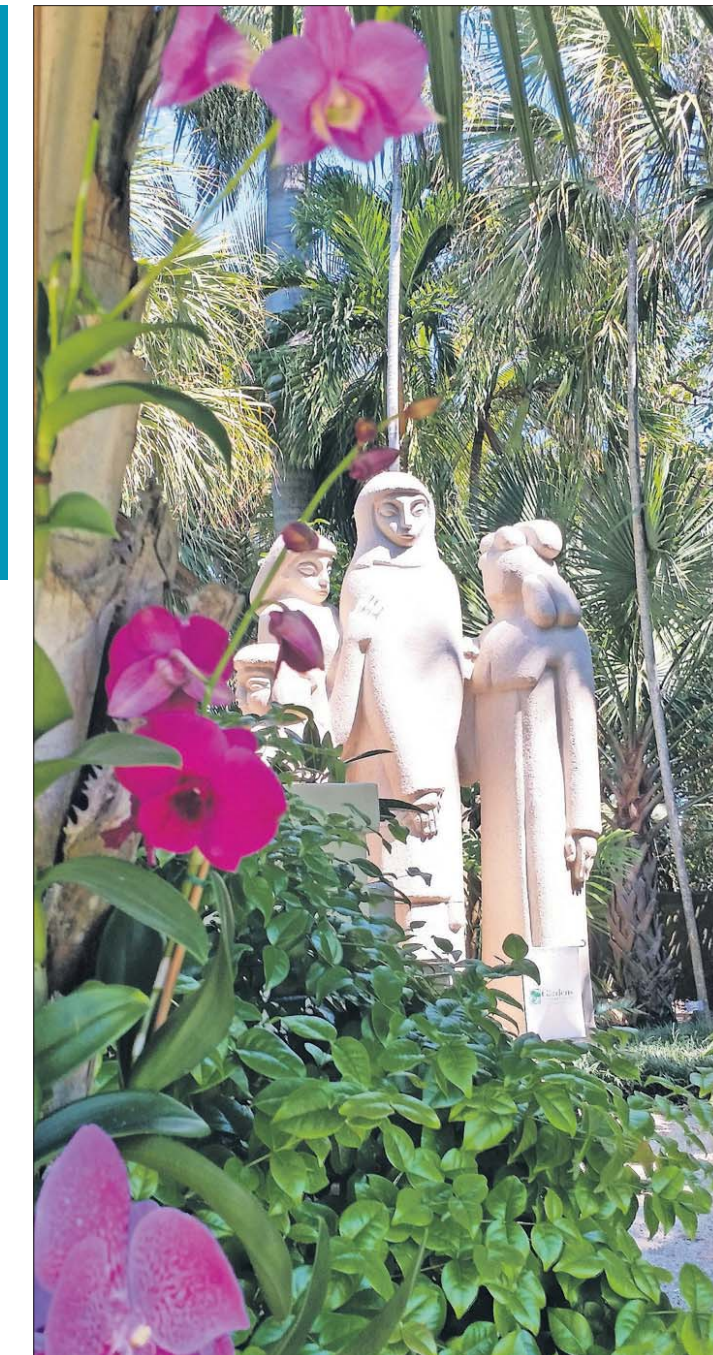
Orchids and the Seven Beings at the Ann Norton Sculpture Gardens.

Lysander Piano Trio, Norton Museum of Art